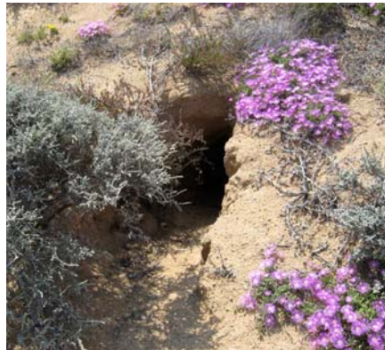
Verlassener Bau eines Erdwolfs

Die Statur der Erdwölfe erinnert stark an kleine Hyänen. Mit ihren langen Beinen erreichen sie eine Schulterhöhe von ungefähr 50 Zentimetern, wobei die Schultern höher liegen als das Becken. Obwohl sie bis zu einem Meter lang werden, sind sie sehr schlank gebaut und wiegen im Mittel 9 Kilogramm. Wie Hyänen haben sie eine nackte Schnauze. Ausserdem eine lange Mähne und einen buschigen Schwanz. Das Fell ist von Vertikal- und Querstreifen durchzogen und grau bis rotbraun.