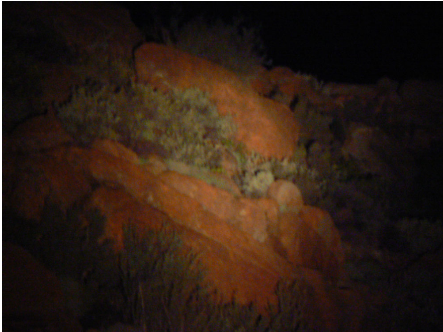
Here is the picture I got from Goegap. I (Carsten) cant even see where the animal should be!