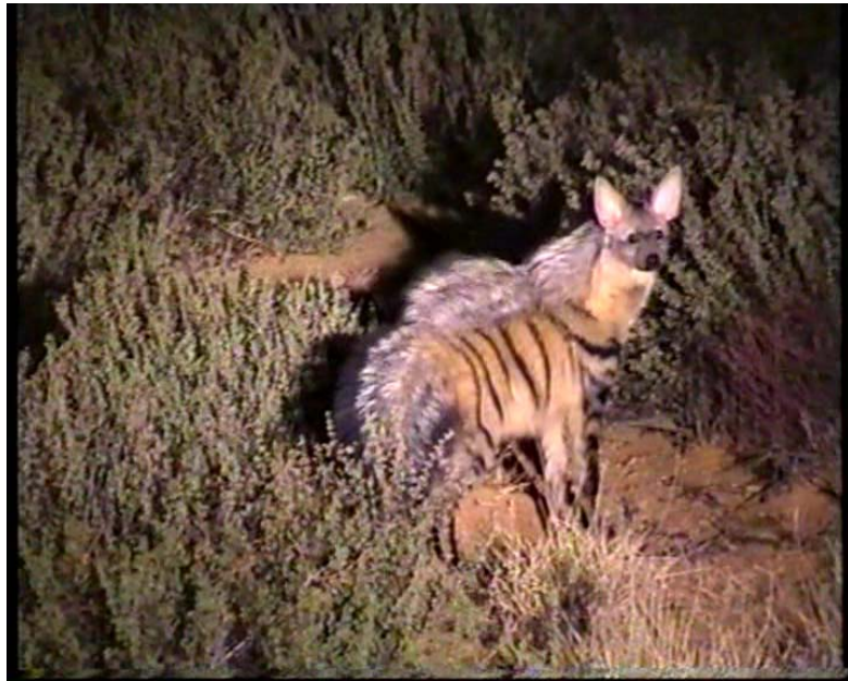
Erdwolf in Goegap, mit aufgestellter Mähne!

dauern. Eine kühle Brise kommt auf und Tropfen beginnen aus den grauen Massen zu fallen. Unwillig, aber ohne Verzögerung dreht sich der Räuber um die eigene Achse und bricht seinen Streifzug ab. Pech heute Nacht. Nur knapp hunderttausend Opfer. Doch die Jagd fortzusetzen ist zu kostspielig. Mit wehendem Schweif und wilder Mähne verschwindet die Kreatur in der Erde. Nächste Nacht wird er mehr erbeuten müssen.