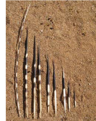
Fig.1. Different types of quills that can be found on one porcupine

parameters also influence the density of individuals in an area; the density is lower and the home range larger when food is scarce.