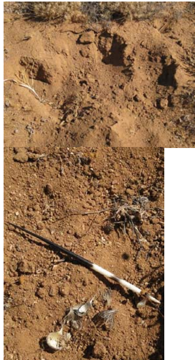
Fig.2. Possible leftovers of a porcupine feast. a: bulb shells, b: quill

In Goegap reserve, succulent species represent most of the plant diversity and I am not sure that porcupines are crazy about them. On the other hand, according to the density of anthills and the numbers of diggings, Goegap really seems to be a paradise for aardvarks!