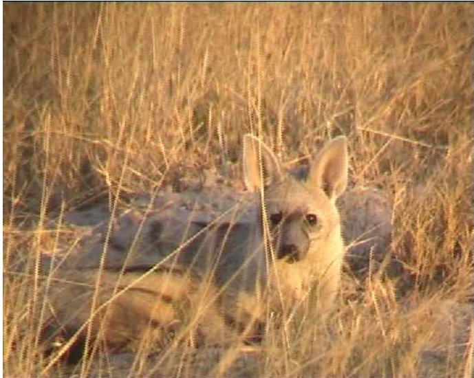
Sich in der Abendsonne sonnender Erdwolf vor seinem Bau.